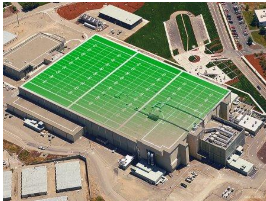
The $10 billion National Ignition Facility (NIF)